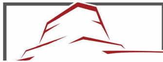
EXHIBIT: A SHEET: 11x17